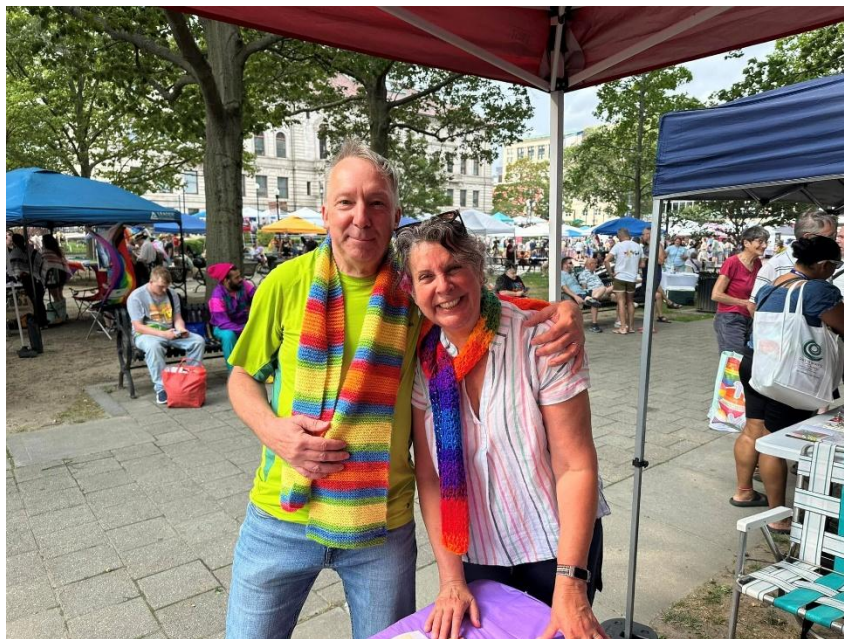
Extending welcome at Worcester Pride!