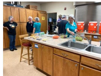
Snacks and Fellowship after the hard work!