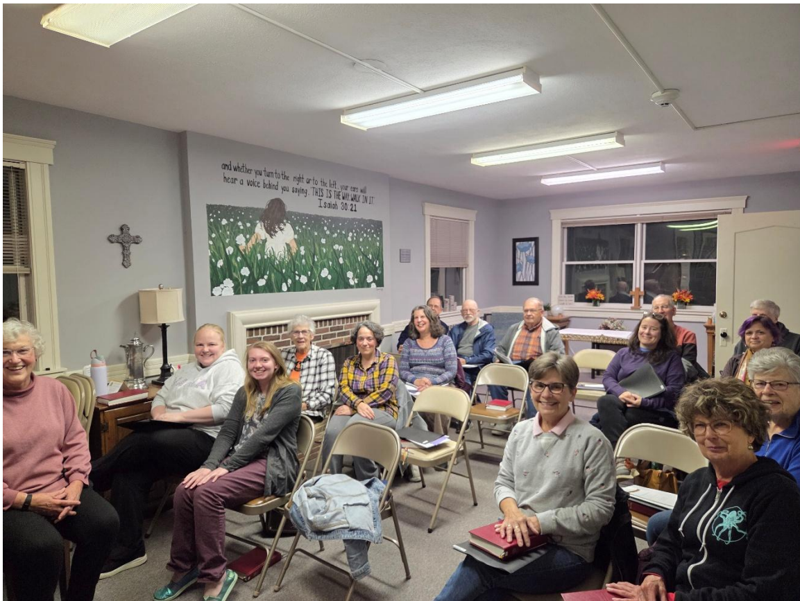
The choir rehearses. Notice all the smiles!