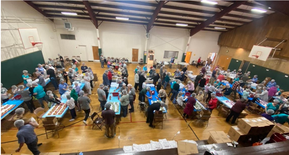
The gym was filled with 8 assembly lines!