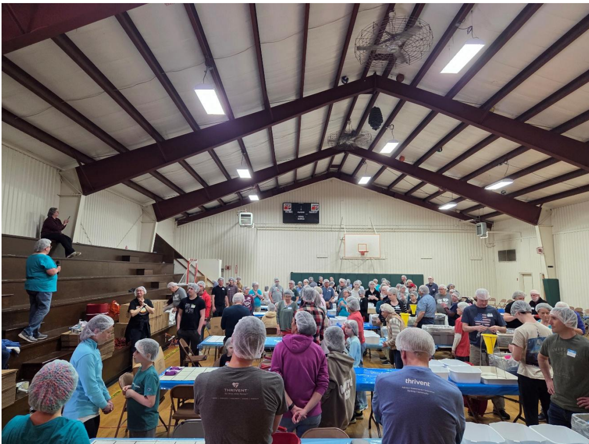
A congregation that serves together.