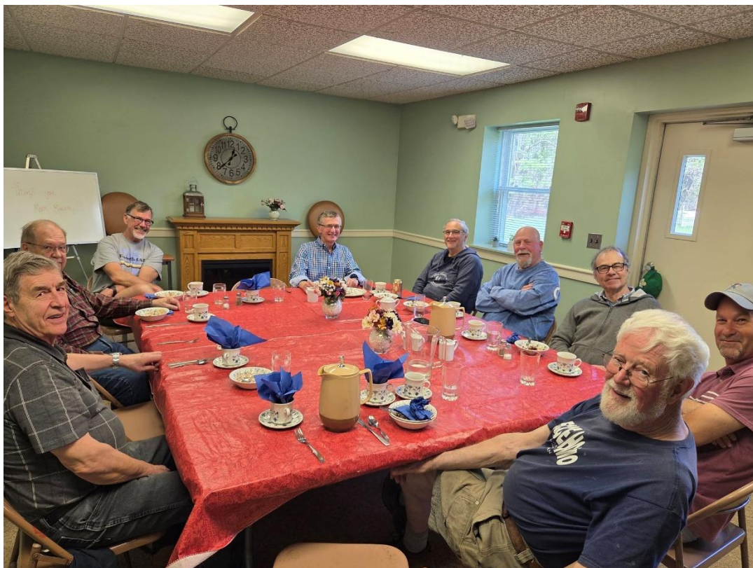
Some members of our Men's Ministry. We are thankful for them!