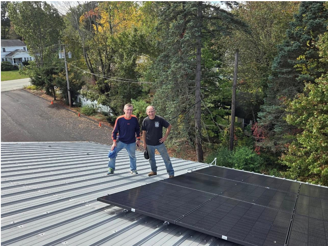
Immanuel's new solar panels went live in October 2025!