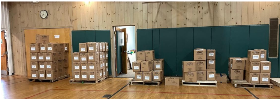
Finished cases to be donated