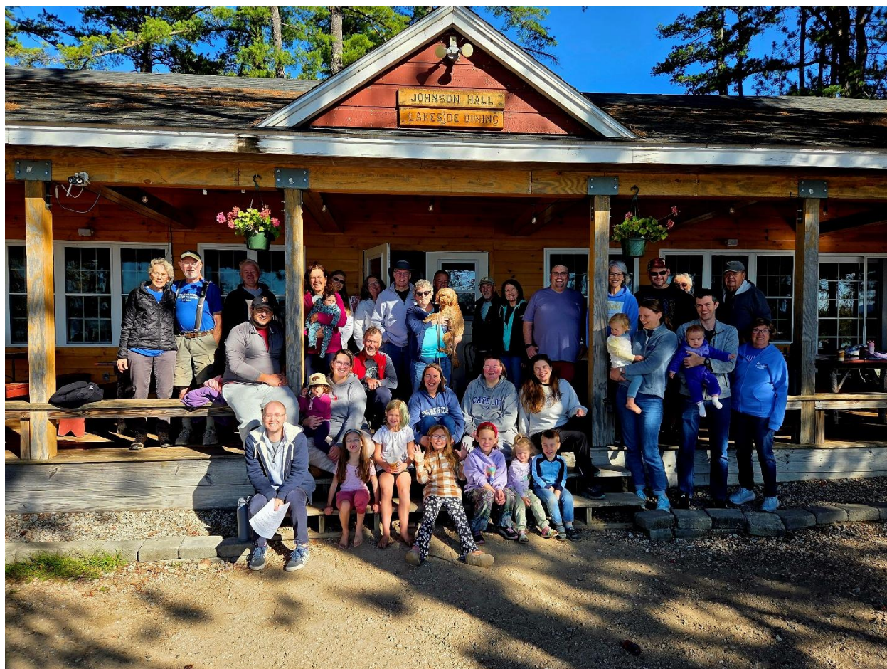
Our 2025 Calumet Getaway Weekend Group. This year's theme was "All Things New."

In further accordance with those bylaws, the Immanuel's Council has voted to use 2.5% ($13,500) of the fund's balance for ministry needs and projects in the upcoming year. This is the minimum amount that must be used for this purpose each year. This money will be spent at the Council's discretion and reported to the congregation at its Annual Meeting next year.