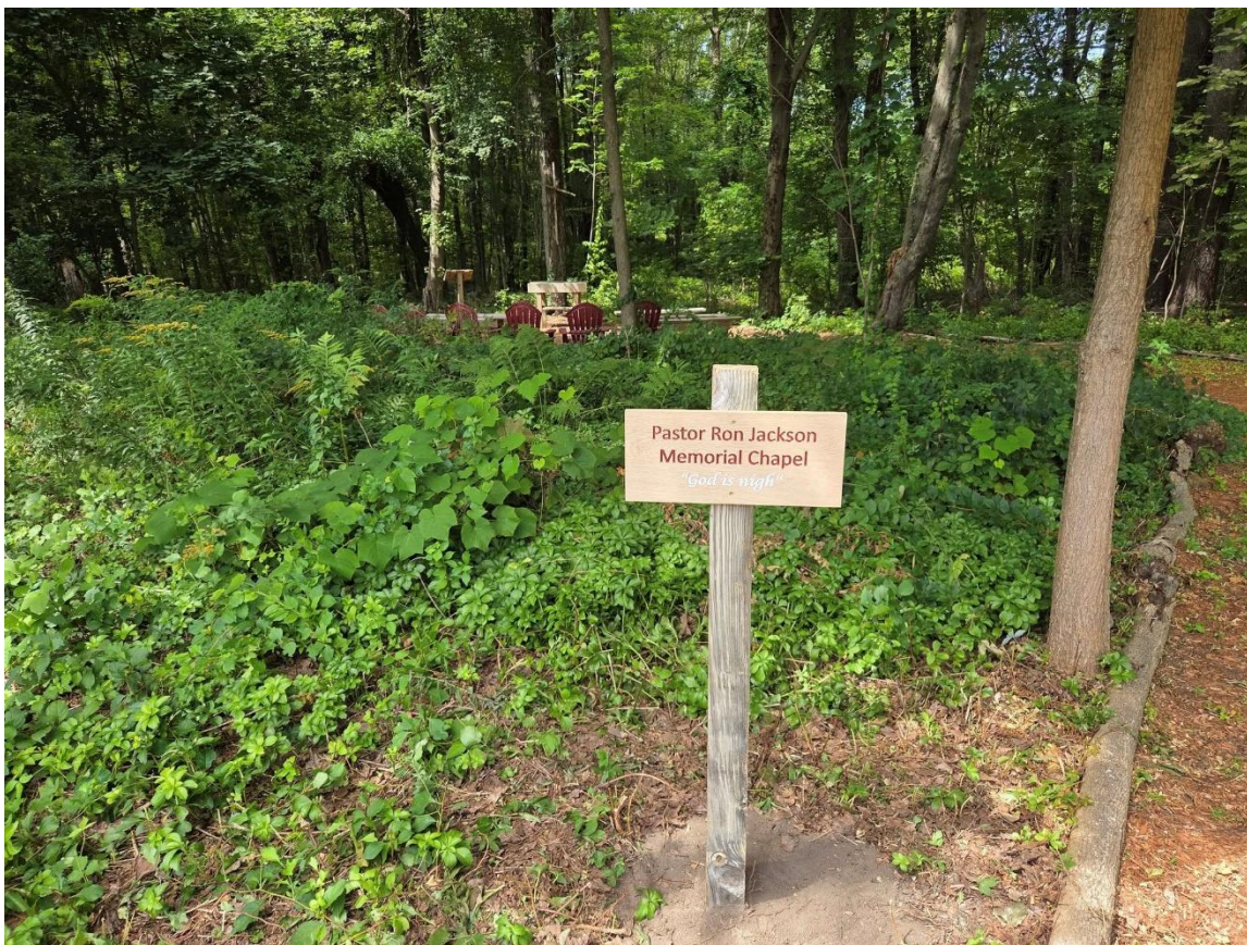
A new sign naming the Pastor Ron Jackson Memorial Chapel. What a beautiful way to honor our beloved friend.