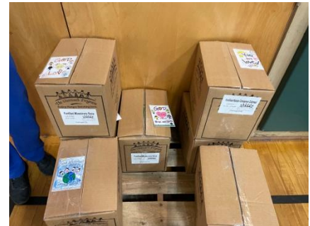
Decorated cards were put on the cases of meals