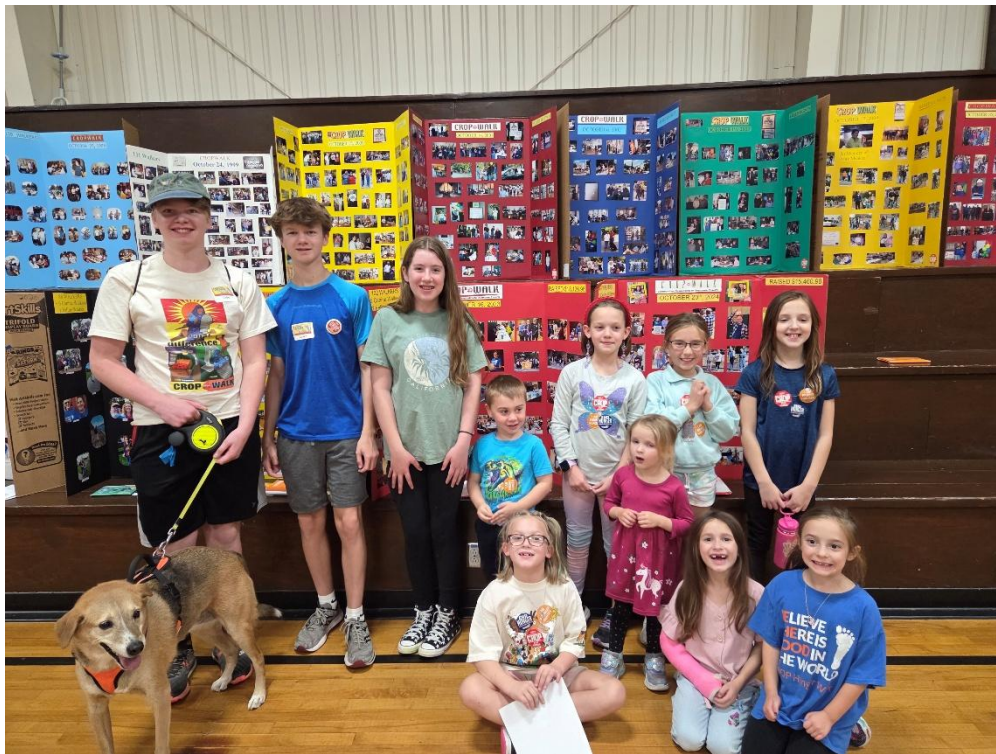
Getting ready for the CROP Hunger Walk!